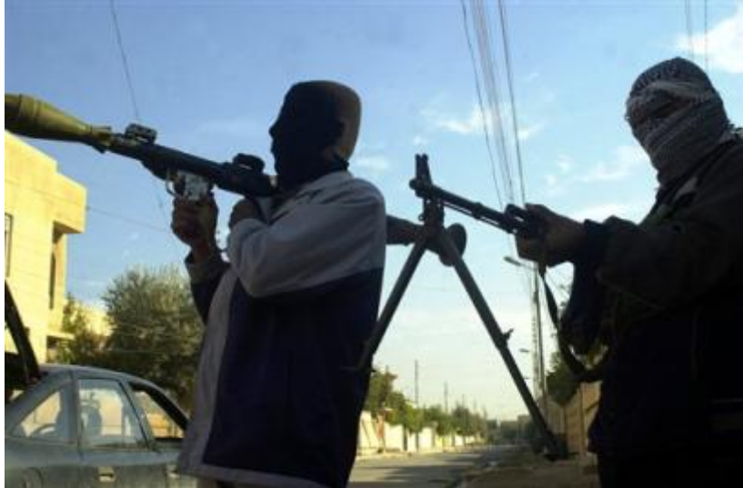
Insurgents carry weapons in Mosul, Iraq Dec. 3, 2004.

December 4, 2004 BAGHDAD (AFP) & AP & By Luke Baker, Reuters