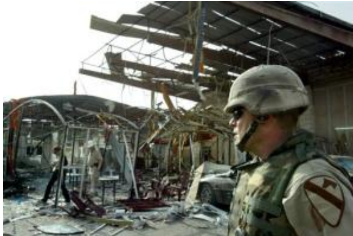
Remains of the Green Zone Cafe, Oct. 15, 2004.