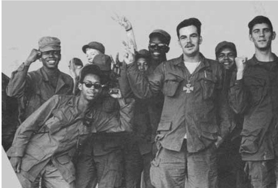
Vietnam: They Stopped An Imperial War