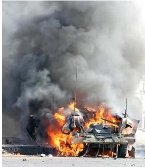
Humvee vehicle burns following attack in Mosul, October 13