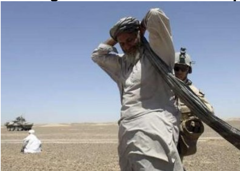
Foreign occupation troops from the USA public humiliate an elderly Afghan on the road near the town of Khan Neshin in Rig district of Helmand province, southern Afghanistan