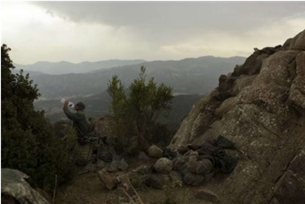
Sept. 15, 2009: Soldiers from the U.S. Army's 3rd Battalion, 509th Infantry Regiment (Airborne), based at Fort Richardson, Alaska, during a patrol in Zerok district, East Paktika province in Afghanistan.

IF YOU DON'T LIKE THE RESISTANCE END THE OCCUPATIONS