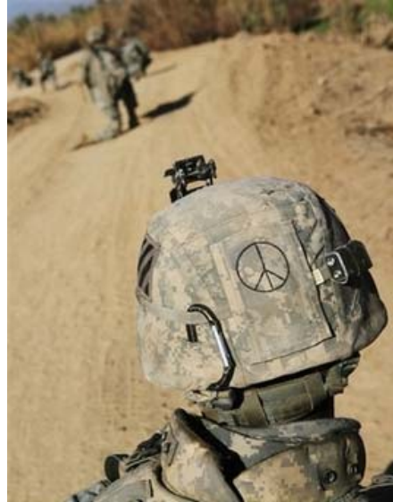
U.S. Army soldier wears a peace sign on his helmet as he patrols in Bejjia village in Arab Jabour, south of Baghdad.