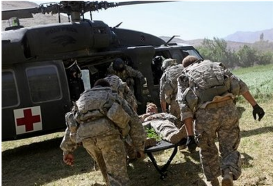
Aug. 19, 2009: Soldiers of the U.S. Army's 10th Mountain Division based out of Fort Drum, N.Y., evacuate a wounded soldier after their armored vehicle hit an improvised explosive device in the Tangi Valley of Afghanistan's Wardak Province.

POLITICIANS CAN'T BE COUNTED ON TO HALT THE BLOODSHED