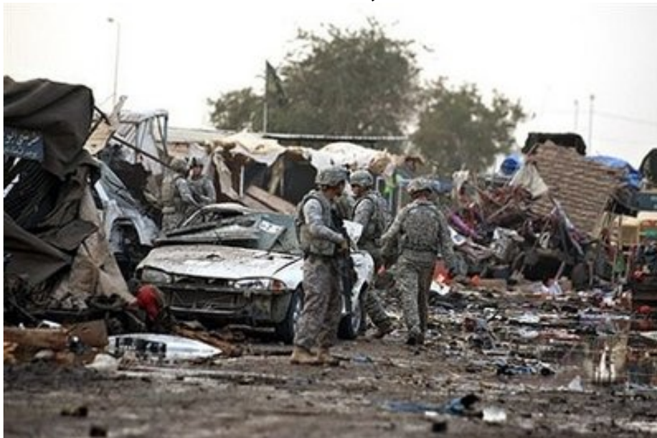
2.14.09: US soldiers at the scene of a twin bombing close to a bus station in the district of Bayah in western Baghdad.