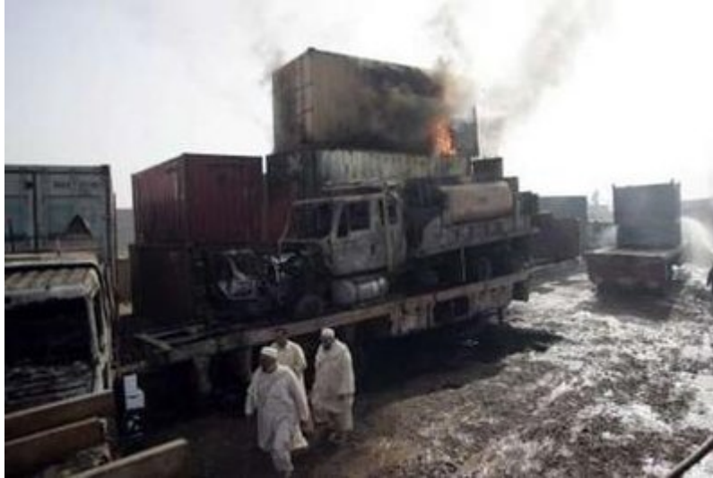
Burnt trucks carrying supplies to Afghanistan occupation forces on the outskirts of Peshawar March 15, 2009.

03/15/09 By RIAZ KHAN, Associated Press Writer