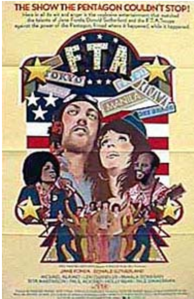
FTA IS BACK: SEE BELOW