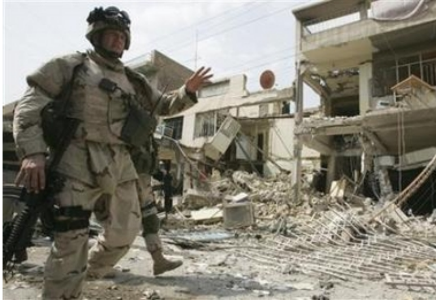
US troops near Sadr City, Baghdad.