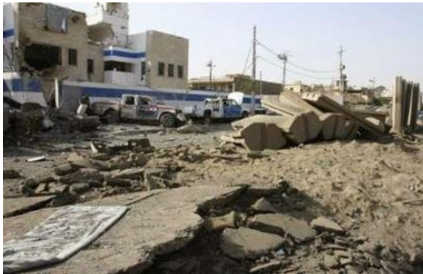
Destroyed police vehicles lie amongst at the scene of a bomb attack in Mosul October 19, 2006. A bomber blew up a fuel truck outside a police centre and rebels fired mortar