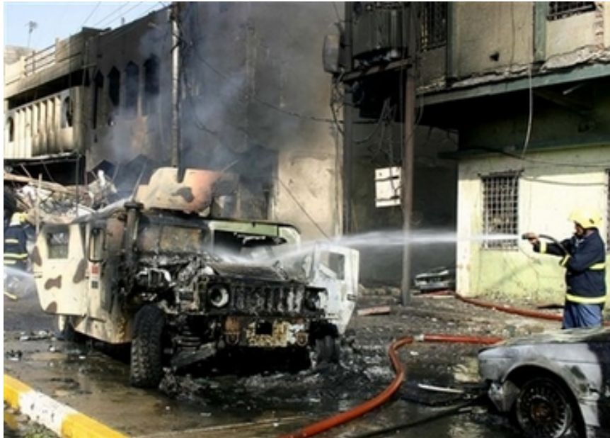
An Iraqi army humvee after a car bomb exploded in Kirkuk Oct, 19, 2006. The Kirkuk bombing was aimed at a bank where a crowd of army soldiers waited to get their wages.

Militants with RPGs and AK47s attacked several police stations in Amara in southern Iraq on Thursday. Army spokesman said. Five Iraqi police were wounded.