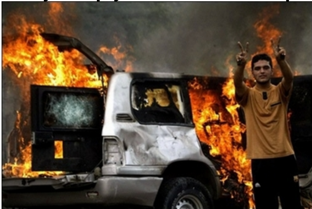
An Iraqi displays the victory sign next to a burning British military SUV in Basra.

Get The Message? “They Simply Hate These Troops”