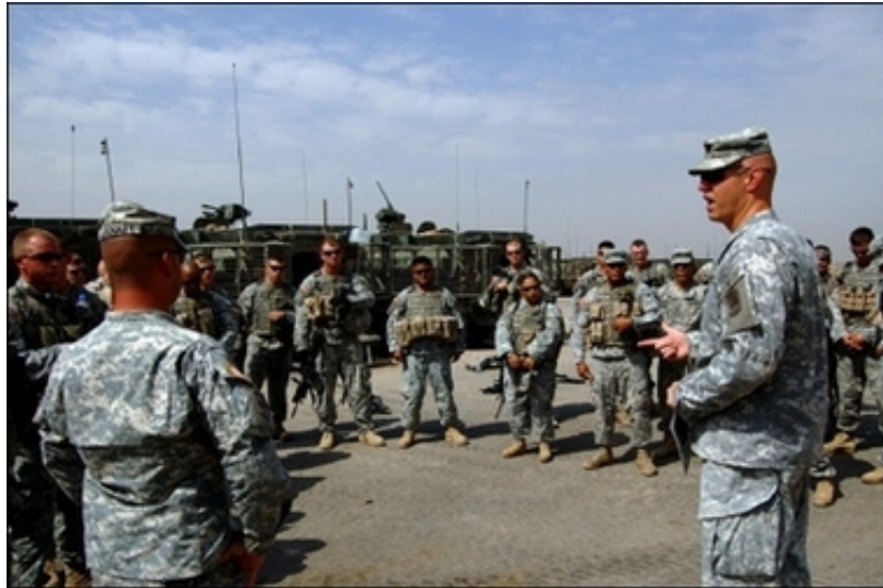
10.4.06: US officer briefs his troops before a patrol in east Baghdad.