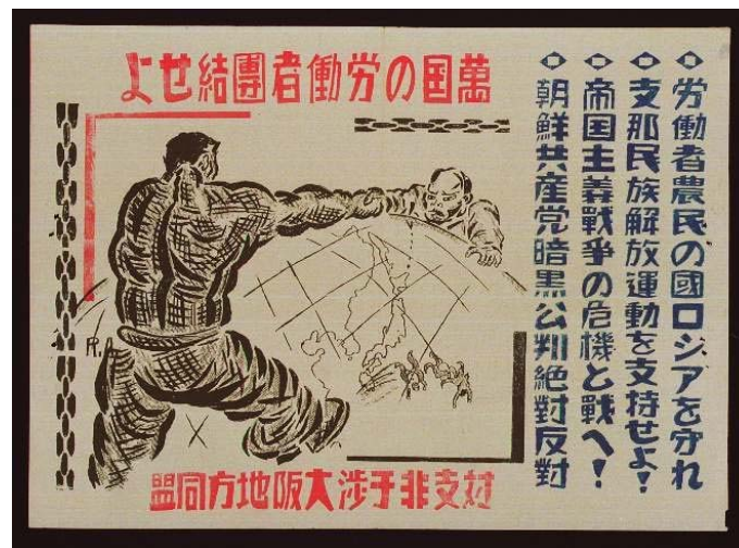
Call To Action

This was what they feared most. That much was for sure.