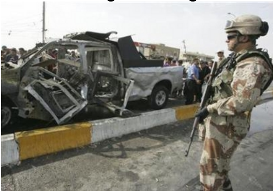
A U.S. soldier at the scene of a roadside bomb attack in Baghdad October 4, 2006.