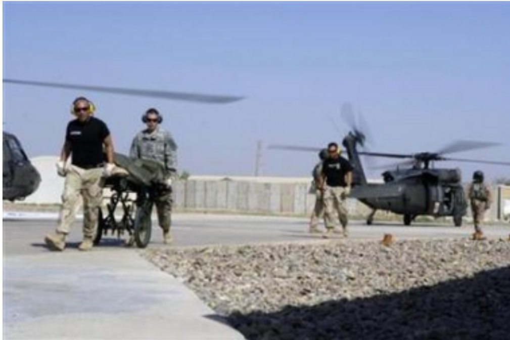
U.S. Air Force and Army medics unload dead and wounded troops off a Black Hawk helicopter at the Air Force Theater Hospital at Balad Air Base.

THIS IS HOW BUSH BRINGS THE TROOPS HOME: BRING THEM ALL HOME NOW, ALIVE