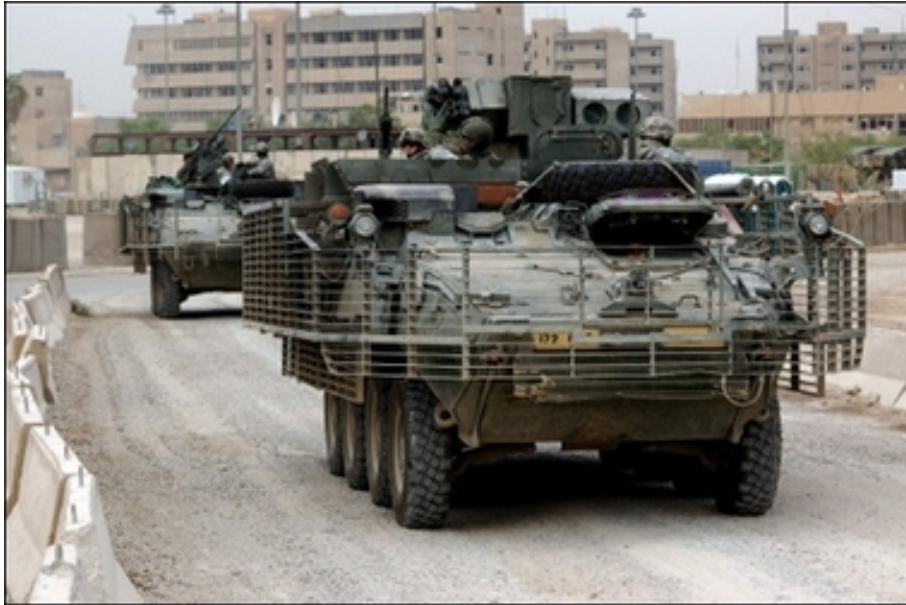
U.S. soldiers from Alfa company 1-17 IN regiment of the 172th brigade in eastern Baghdad, Oct. 3, 2006.