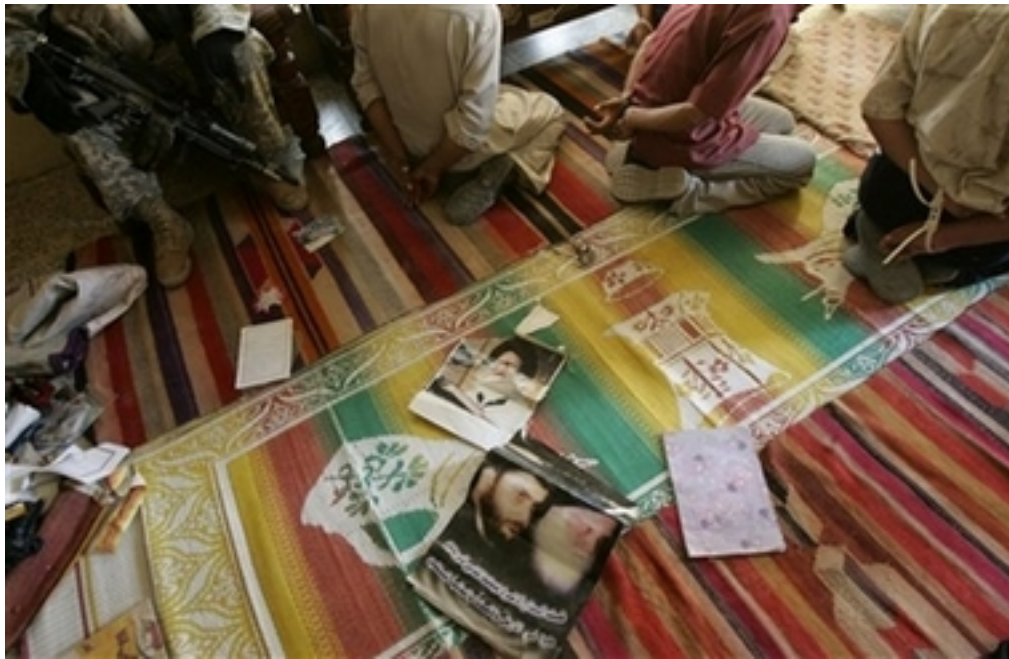
A U.S. soldier from Alfa company 1-17 IN regiment of the 172th brigade takes Iraqis prisoner in their own homes, after breaking in a gunpoint. The Iraqi citizens are taken prisoner after weapons and propaganda material were found in their house in eastern Baghdad, Oct. 3, 2006.