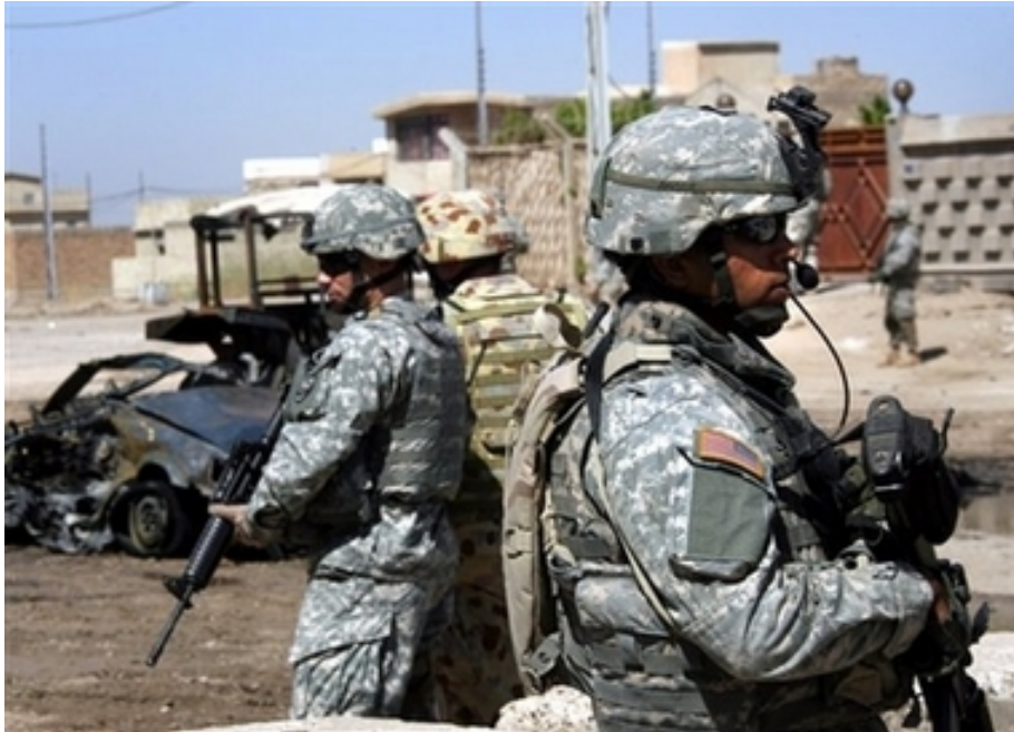
U.S. soldiers secure the site of a car bomb explosion, in Baghdad Sept. 19, 2006.