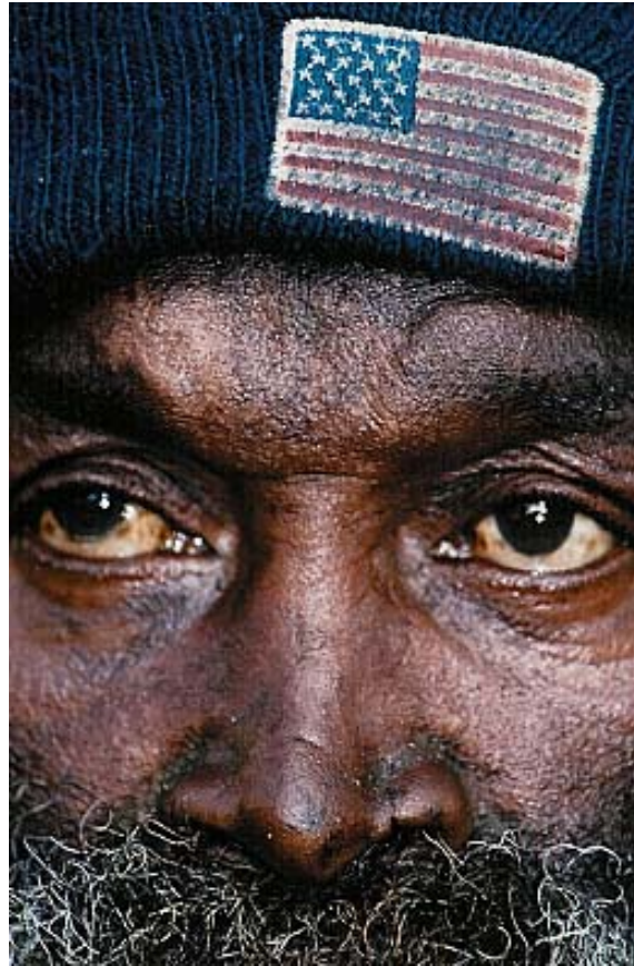
Homeless Vietnam Veteran in San Francisco 2003.

From: Mike Hastie To: GI Special Sent: September 29, 2006 5:34 AM Subject: What Happens When History Is Buried