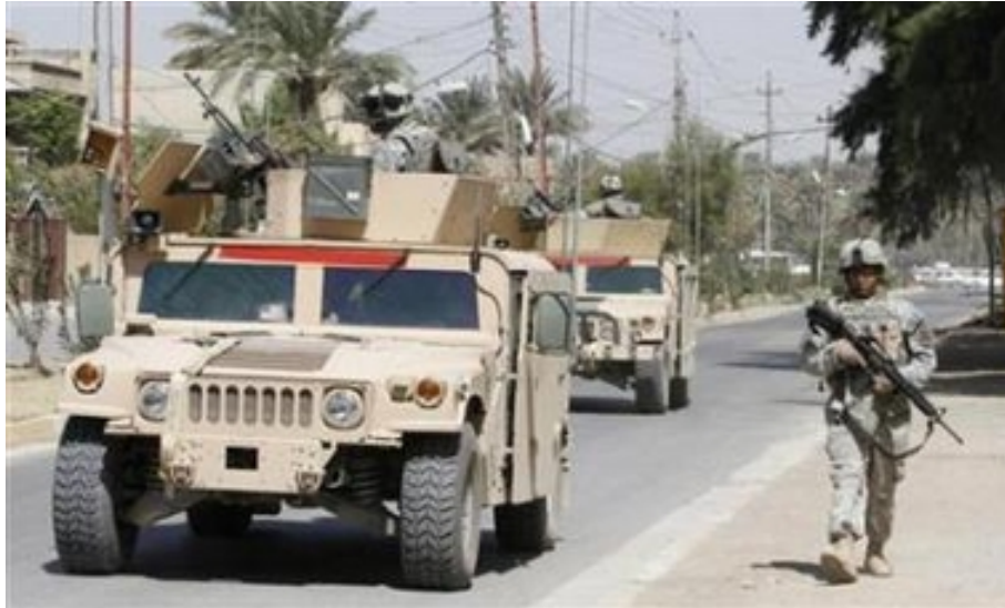
U.S. soldiers patrol a road in central Baquba September 18, 2006.