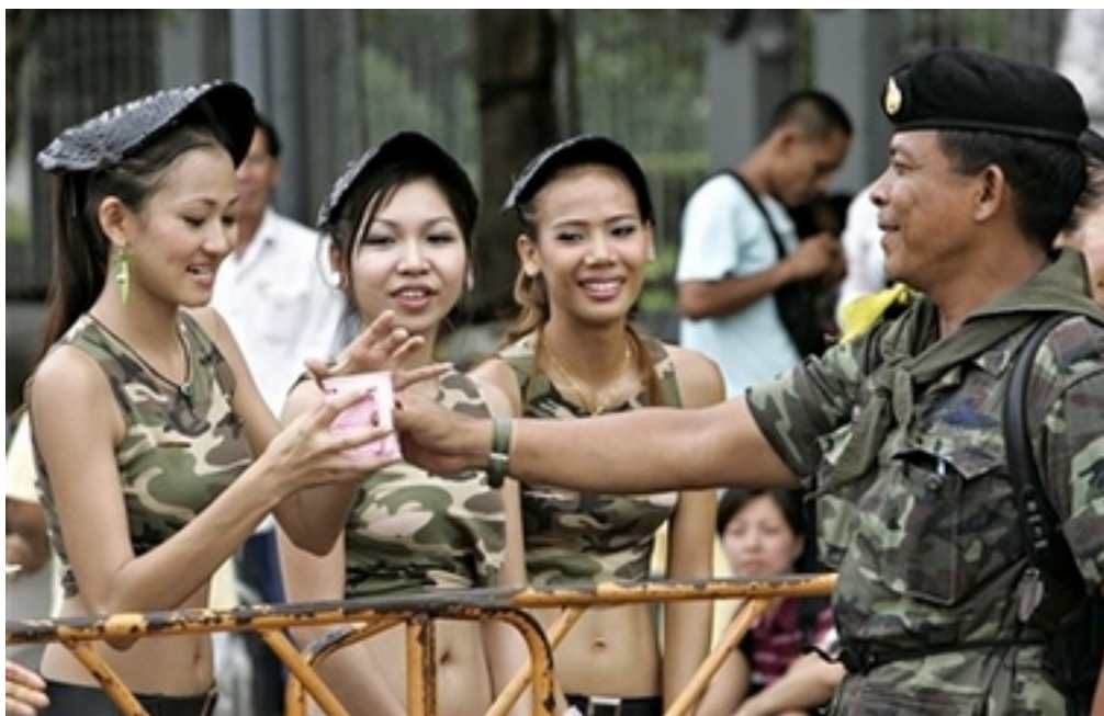
A soldier gives the group of Thai women some water. Sept. 25, 2006.