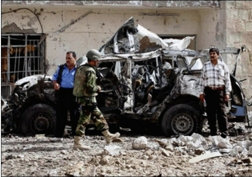
The wreckage of a police vehicle in Kirkuk.

24 September 2006 By DAVID RISING, The Associated Press & Reuters & Multi-National Division – Baghdad PAO RELEASE No. 20060924-01 & AFP