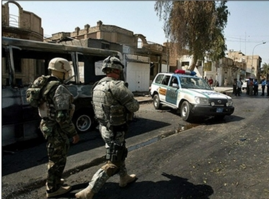
9.24.06 US soldiers at the site where a car bomb exploded in Baghdad.