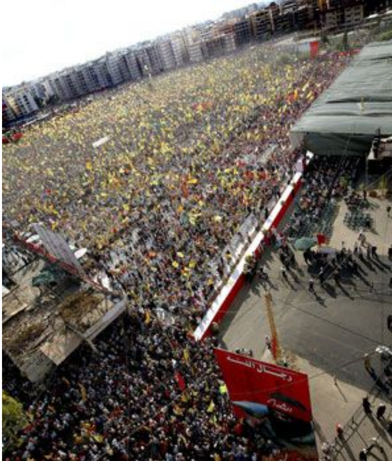
General view of Hezbollah supporters waving red and white national flags and the Shiite Muslim group's yellow flags at a massive rally in the southern suburbs of Beirut, Lebanon, 22 September 2006