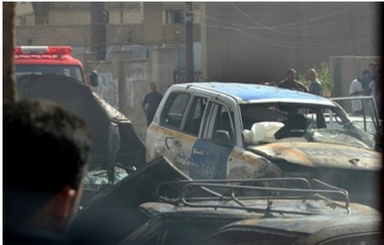
Blown up police vehicle following a car bomb explosion in Baghdad Sept. 24, 2006.

In Diyala province a police officer shot near his home at the provincial capital in Baquba.