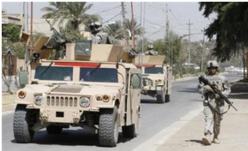
U.S. soldiers patrol a road in central Baquba September 18, 2006.

REALLY BAD IDEA: NO MISSION; HOPELESS WAR: BRING THEM ALL HOME NOW