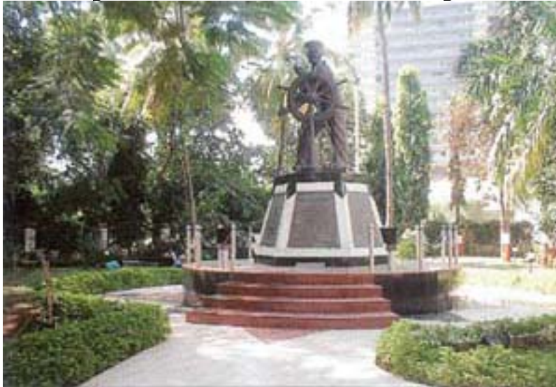
RIN Mutineer's Memorial in Mumbai.