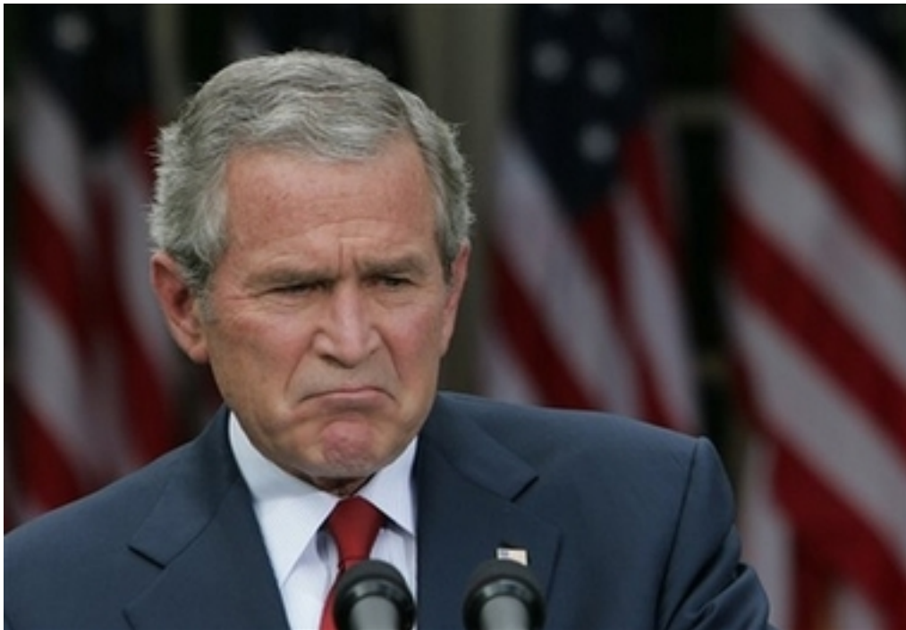
Sept. 15, 2006