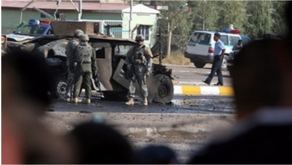
U.S. soldiers inspect one of their damaged and burnt armored vehicle after a car bomb attack, in Baghdad Sept. 9, 2006.