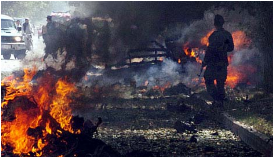
An Afghan policeman secures the site of a suicide car bomb blast Friday in the Afghan capital Kabul.