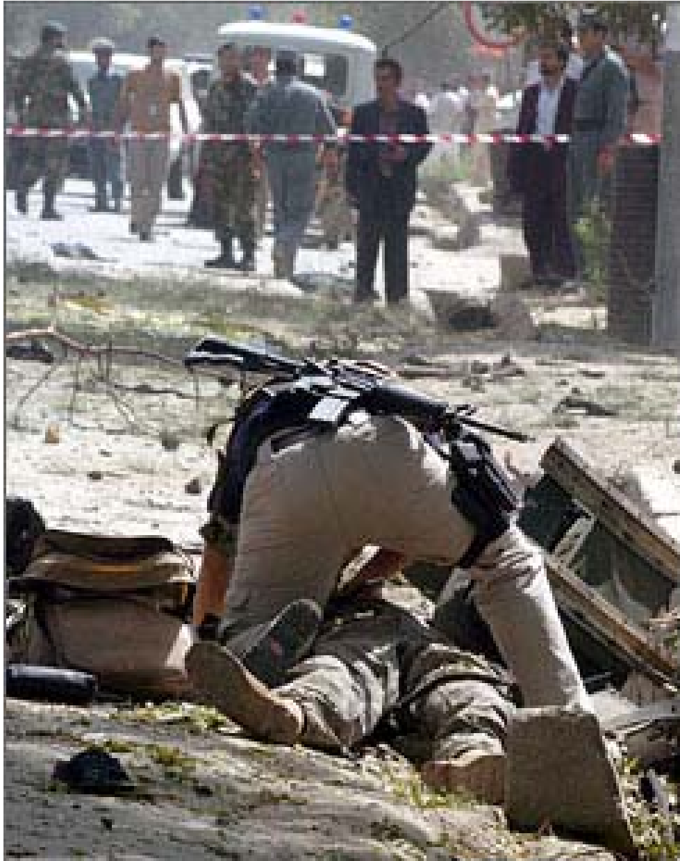
A U.S. soldier killed in a car bomb blast outside the U.S. embassy in Kabul.