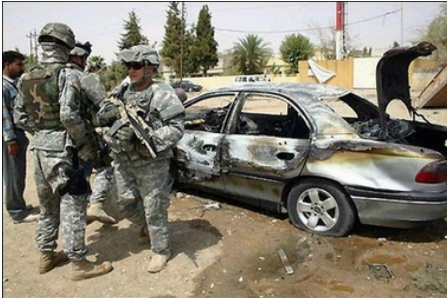
8.06 US Marines at the scene where a car bomber blew himself in Kirkuk.