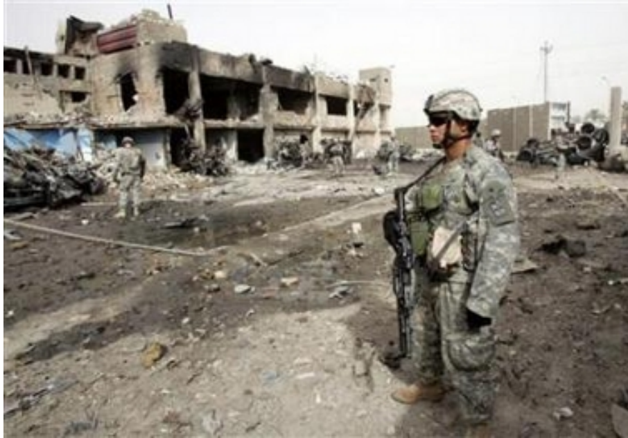
A U.S. soldier at the site of a car bomb explosion, in Baghdad Aug. 27, 2006.