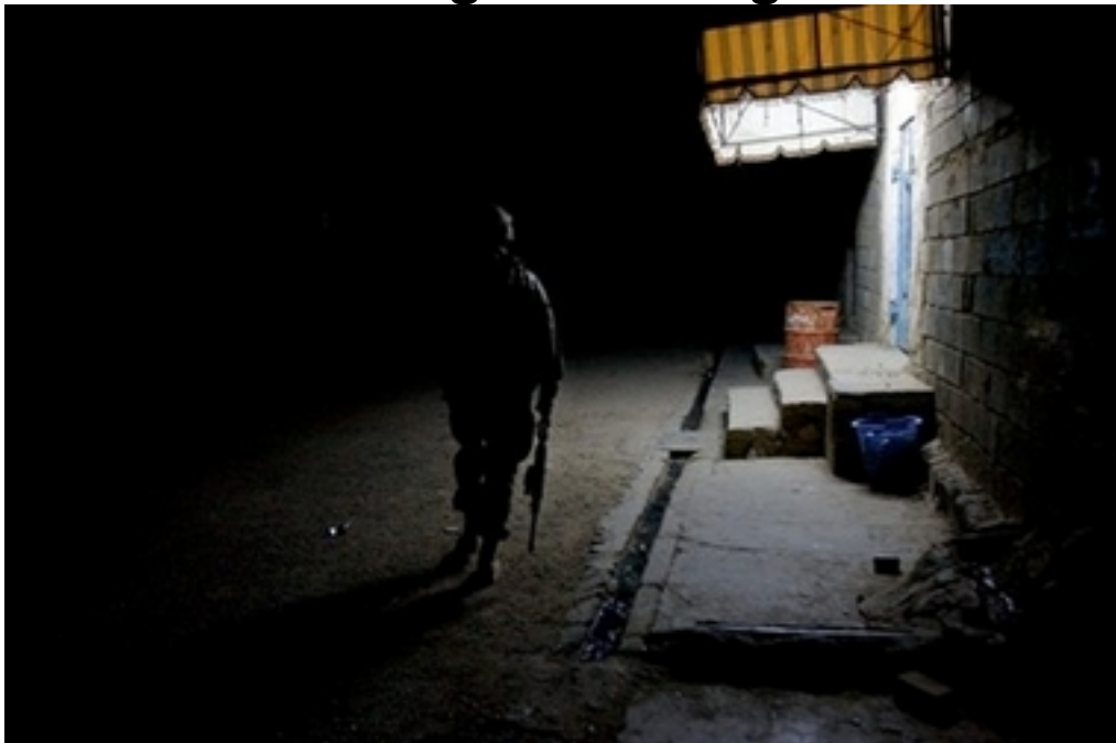
A U.S. Marine patrols at night in Ramadi June 28, 2006.