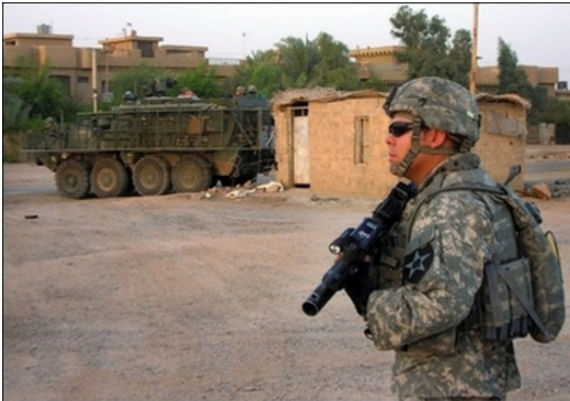
A US soldier patrols a street in Baghdad's Ghazaliya neighborhood, August 15.