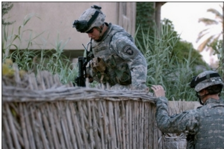
8.4.06: A US soldier in the Dura market of southern Baghdad.