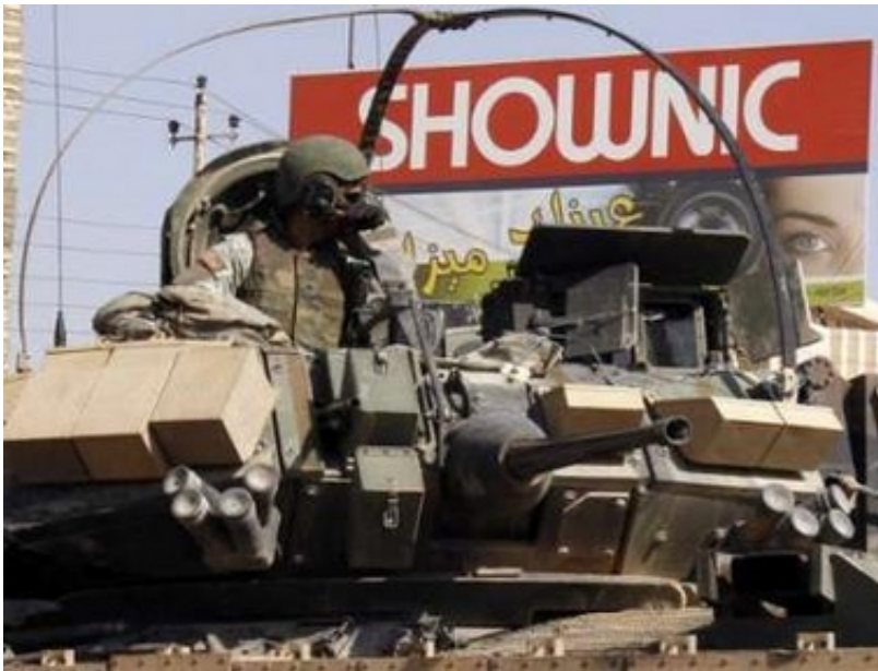
A U.S. soldier sits on a tank near the scene of two roadside bomb attacks in the Saiidiya district south of Baghdad July 15, 2006.