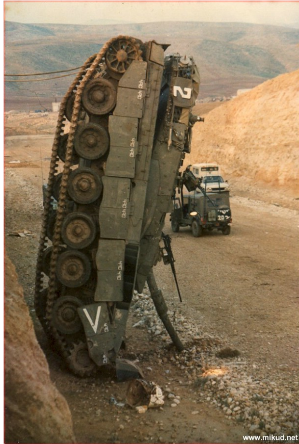
A Merkava nose dive

What do you think? Comments from service men and women, and veterans, are especially welcome. Send to contact@militaryproject.org . Name, I.D., withheld on request. Replies confidential.