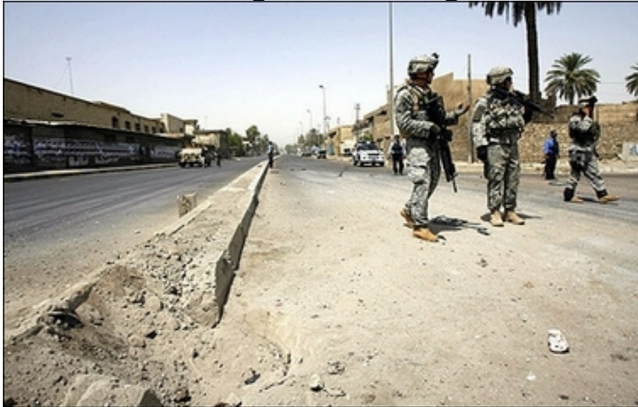
7.12.06 US Army soldiers at the scene of an exploded improvised explosive device, or IED, that killed one person, in the Wazariya neighborhood in northern Baghdad.