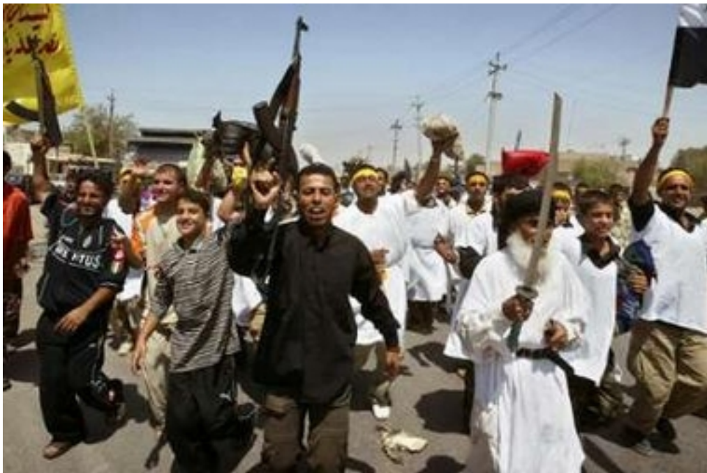
Iraqi men, young and old, carry their weapons during an armed demonstration in Baghdad's Sadr City August 4, 2006. A million Iraqis massed in Baghdad on Friday to condemn Israel and the U.S. REUTERS/Kareem Raheem (IRAQ)