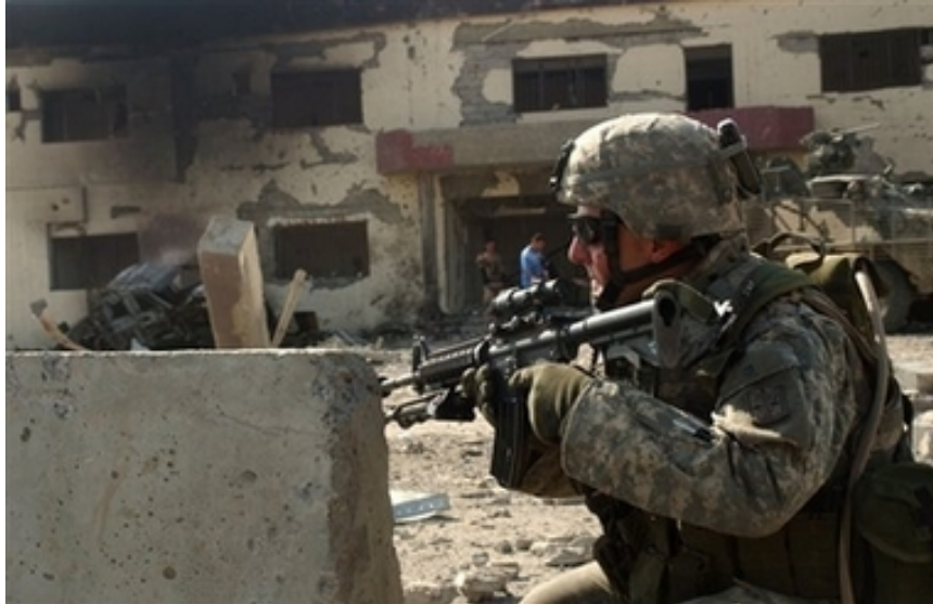
U.S. military at area of a car bomb attack July 5, 2006, in Mosul.