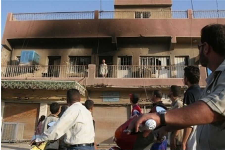
Iraqi citizens stop to view a home that was burned during a raid by U.S., July 23, 2006, in Sadr City, Baghdad.

[Fair is fair. Let's bring 150,000 Iraqis over here to the USA. They can kill people at checkpoints, bust into their houses with force and violence, butcher their families, overthrow the government, put a new one in office they like better and call it "sovereign," and "detain" anybody who doesn't like it in some prison without any charges being filed against them, or any trial.]