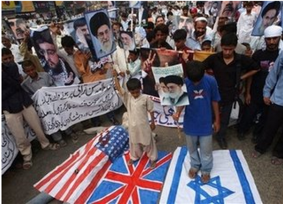
1.23.06 Lahore, Pakistan