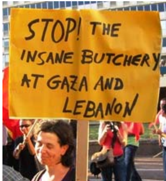
Tel Aviv, July 22, 2006

“What Is Happening In Lebanon Doesn’t Surprise Us At All” “We Ourselves Have Been, And Continue To Be, Slaughtered By Israel On A Daily Basis”