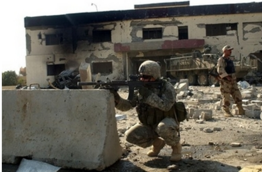
U.S. military at the area of a car bomb attack July 5, 2006, in Mosul.