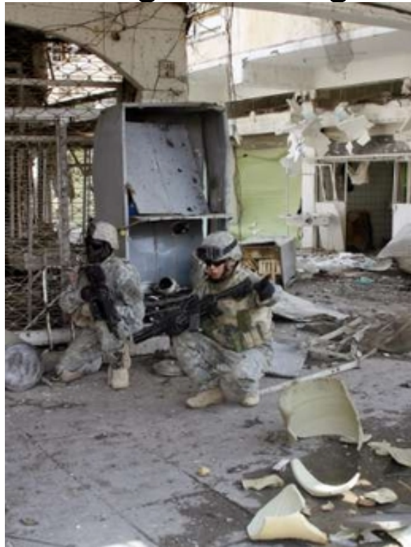
U.S. soldiers take positions at the scene of a car bomb attack in Mosul July 3, 2006. REUTERS/Khaleed al-Mousily (IRAQ)