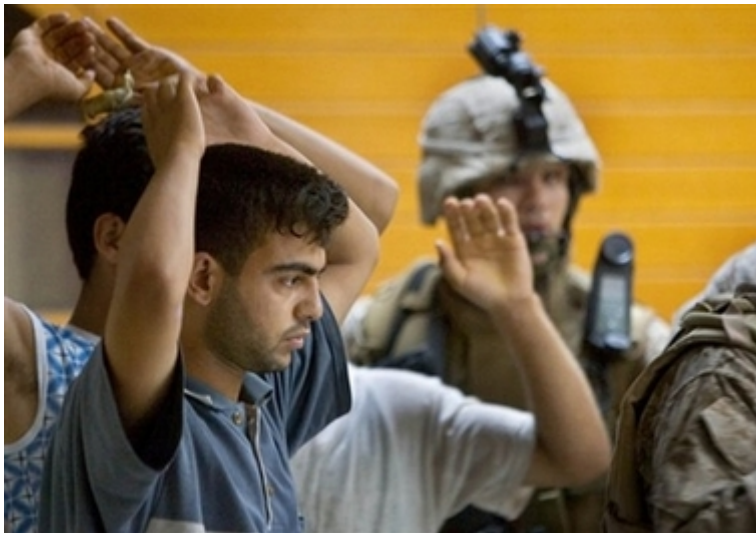
Iraqi citizens in the Ramadi Hospital taken prisoner July 5.

Article 18: Civilian hospitals organized to care to the wounded and sick, infirm and maternity cases, may in no circumstances be the object of attack, but shall at all times be respected and protected by the Parties to the conflict.