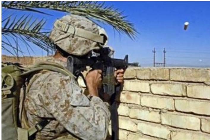
A U.S. Navy Hospital Corpsman fires at insurgents in Ramadi, June 6, 2006.