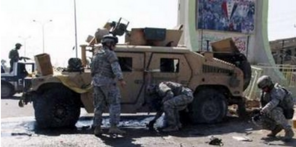
A roadside bomb attack targeting a U.S. convoy wounded one soldier in Kirkuk, about 250 km (150 miles) north of Baghdad, July 2, 2006.