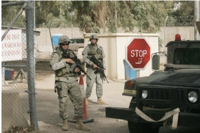
U.S. forces guard the entrances to the U.S. Embassy in Baghdad June 13, 2006 in Baghdad.