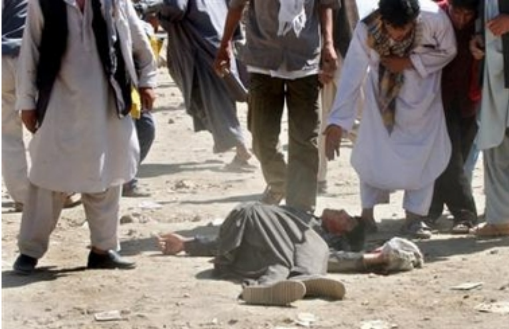
Afghan protesters look at the body of a civilian killed in Kabul, Afghanistan, May 29, 2006.

A U.S. spokesman said American troops shot into the air, and AP Television News video showed a machine gun on a Humvee firing over the crowd as the vehicle sped away.