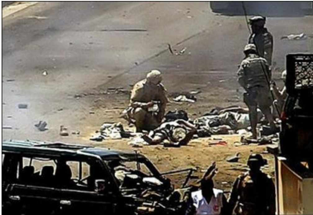
A US soldier treats a wounded colleague at the site where of a car bomb exploded in Baghdad's Tahariyat Square which targeted an American convoy in central Baghdad.

It was one of the deadliest attacks on a U.S. patrol in central Baghdad for some time. Fellow journalists arrived quickly at the scene to see a Humvee armored patrol vehicle in flames and U.S. troops securing the immediate area.