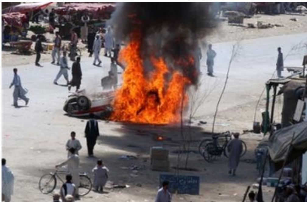
Afghan people look at a burning police vehicle in Kabul May 29, 2006. Panicked U.S. troops killed many civilians and sparked a riot in the capital.

With Kabul in lockdown and sporadic gunfire still echoing through the city, the perception that the US military is the problem and not the solution will certainly grow.