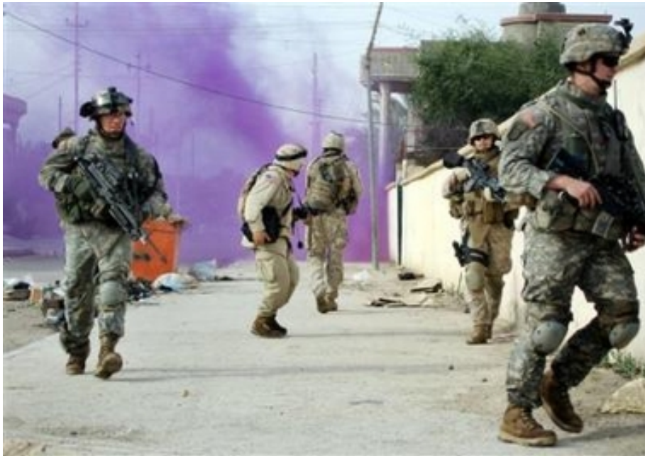
U.S. soldiers run down a street, as purple smoke grenades cover their path, during a gunbattle with insurgents in Ramadi April 22, 2006.