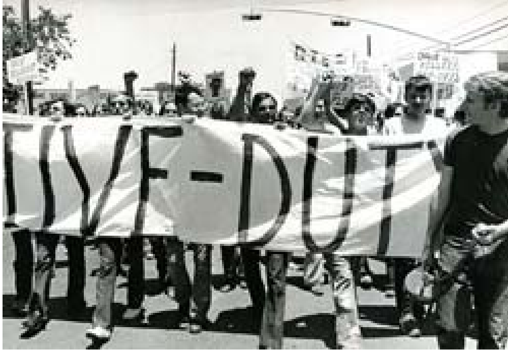
The 1971 Armed Forces Day demonstration of over 1,500 GIs in Killeen, home of Ft. Hood. Guy with the bullhorn is me.