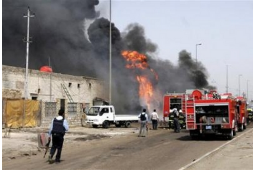
Fire following a roadside bomb that hit an oil tanker Baghdad, May 15, 2006.

5.15.06 By THOMAS WAGNER, Associated Press Writer & Reuters