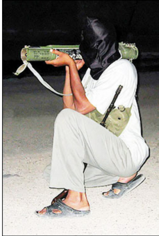
An insurgent with shoulder-fired rocket in Ramadi late 10 May 2006.

May 12, 2006 (CBS News) RAMADI, Iraq [Excerpts]