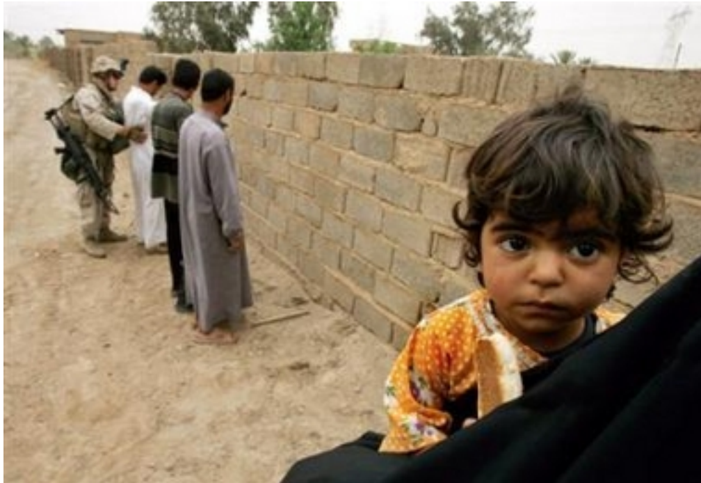
An Iraqi girl sits in her mother's arms while male family members are searched by a U.S. Marine at a checkpoint in Karmah April 24, 2006.

[Fair is fair. Let's bring 150,000 Iraqis over here to the USA. They can kill or simply humiliate citizens at checkpoints, bust into their houses with force and violence, overthrow the government, put a new one in office they like better and call it "sovereign," and "detain" anybody who doesn't like it in some prison without any charges being filed against them, or any trial.]