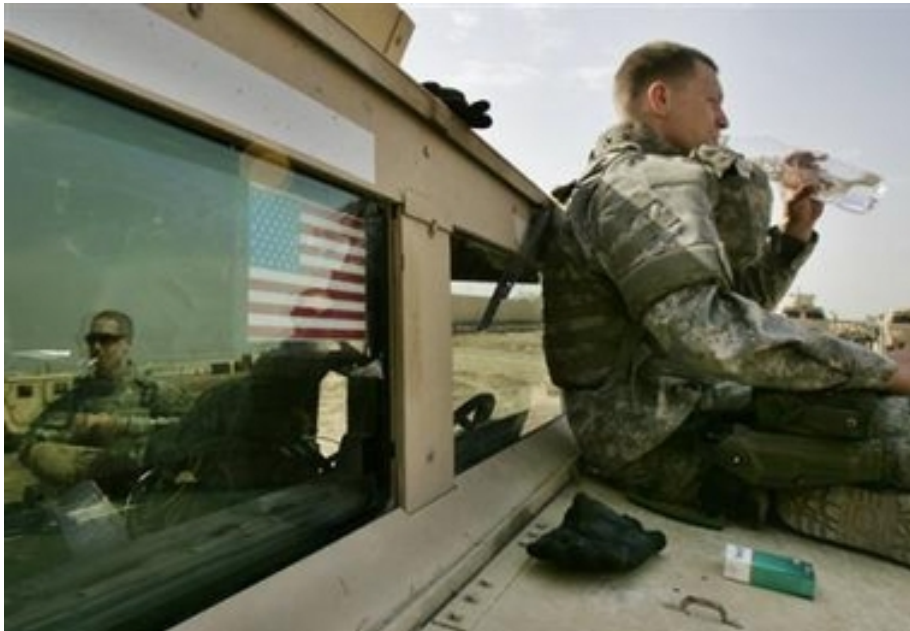
A U.S. soldier before a patrol in Baghdad, April 16, 2006. U.S. troops have begun placing American flags on their windshields in order to distinguish their humvees from those used by Iraqi troops.