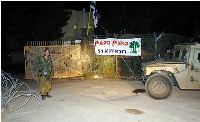
Entrance to post on northern border abandoned by rebelling soldiers.

[Thanks to Max Watts, who sent this in.]