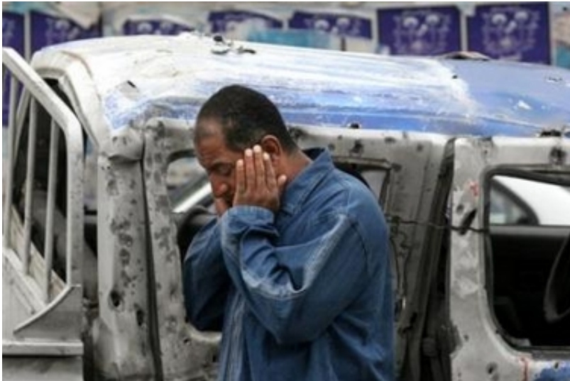
A police vehicle destroyed by a car bomb which targeted a police patrol, killing a policeman and two civilians April 12, 2006 in Baghdad.