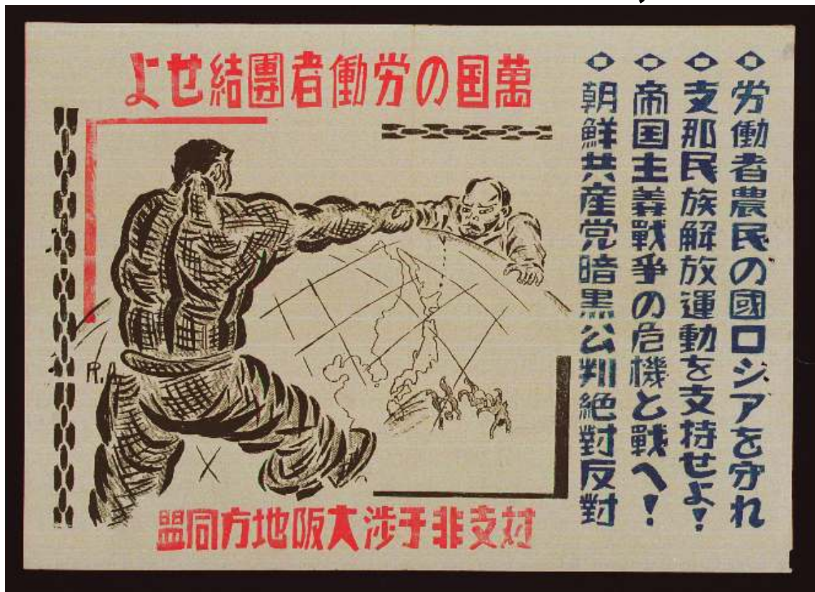
Japanese anti-imperialist poster from late 1920s, by the Alliance Against Intervention in China.