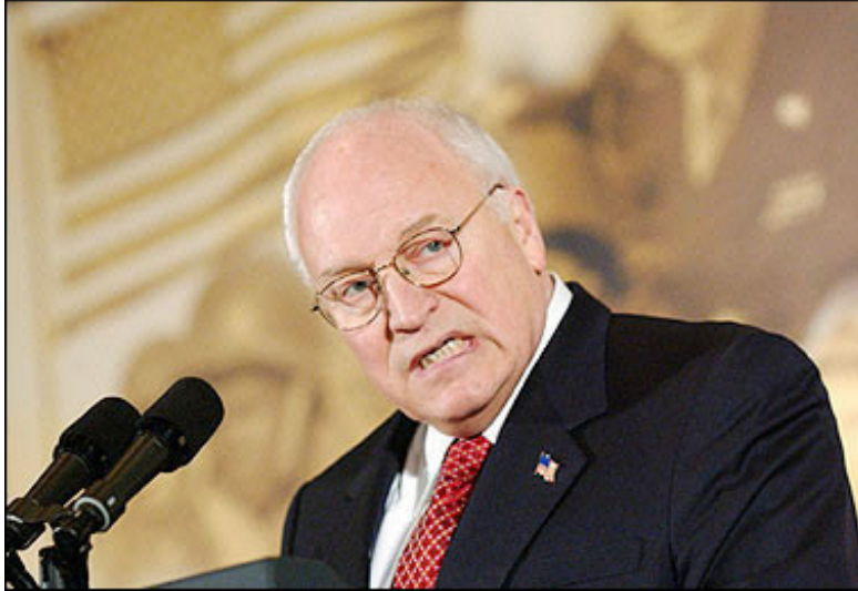
February 2005.