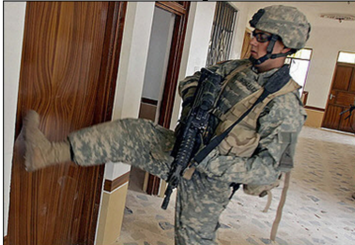
A US soldier kicks a door in Tal Afar, 02 April 2006.

[Fair is fair. Let's bring 150,000 Iraqis over here to the USA. They can kill people at checkpoints, bust into their houses with force and violence, overthrow the government, put a new one in office they like better and call it "sovereign," and "detain" anybody who doesn't like it in some prison without any charges being filed against them, or any trial.]