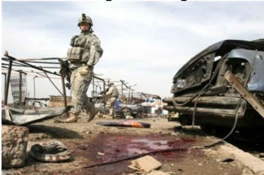
A US soldier passes the bloody wreckage of a car bomb explosion in Baghdad April 4, 2006.