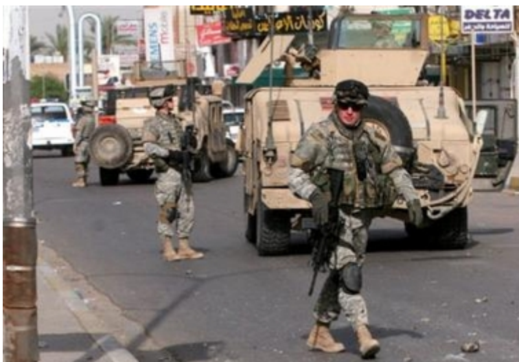
American soldiers secure the site of a roadside bomb explosion April 5, 2006 in Baghdad.