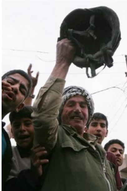
Celebrating Iraqis hold up a U.S. helmet after a roadside explosion targeting a US Patrol destroyed a Humvee April 2, 2006 in Ramadi, Iraq.

Nothing Is More Important Today Than Forging New Links With The Troops Turning Against This War: