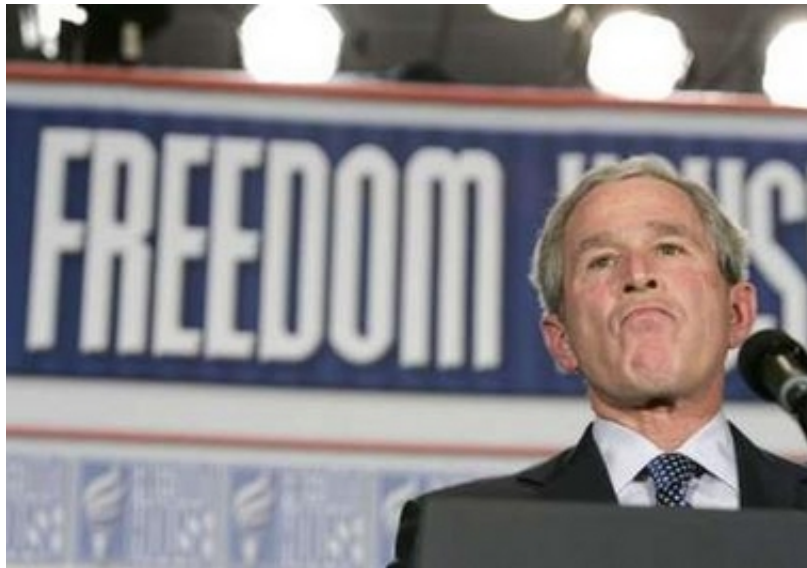
March 29, 2006.