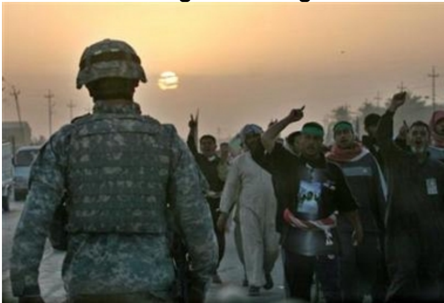
A U.S. soldier facing angry Iraqi citizens condemning the occupation in Hilla, Iraq, March 19, 2006.