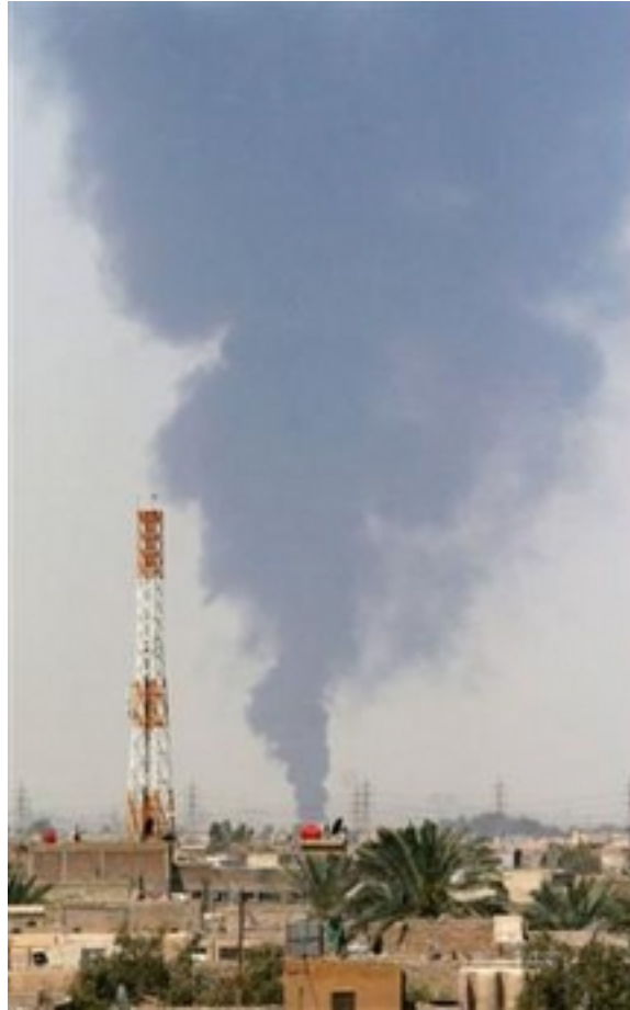
Smoke rises from a pipeline explosion March 31, 2006 in Baghdad. Insurgents set off explosives underneath an oil pipeline on the outskirts of Baghdad Friday.

IF YOU DON'T LIKE THE RESISTANCE END THE OCCUPATION