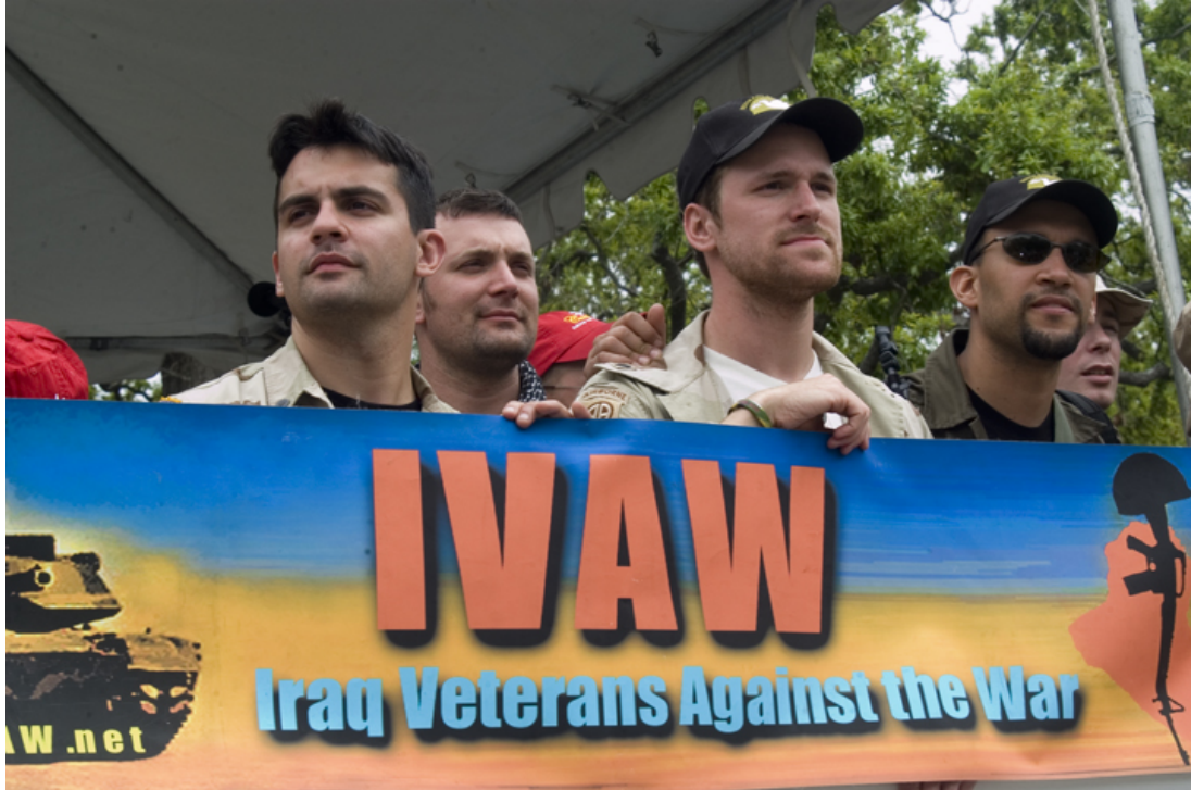
March 18 and 19, 2006. New Orleans: Walkin' to New Orleans. A coalition of veterans and military families and Hurricane Survivors walked from Mobile to New Orleans for the 3rd Anniversary of the war in Iraq.

Pentagon Traitors At It Again: Army Making Wounded Iraq War Vet Repay Enlistment Money: They Confiscated His Pay Check; Sent Collection Agency After Him