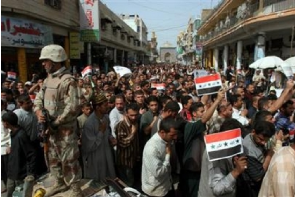
Iraqi soldiers protect Iraqis shouting anti American slogans, during a protest march after Friday prayers, in Baghdad March 24, 2006.