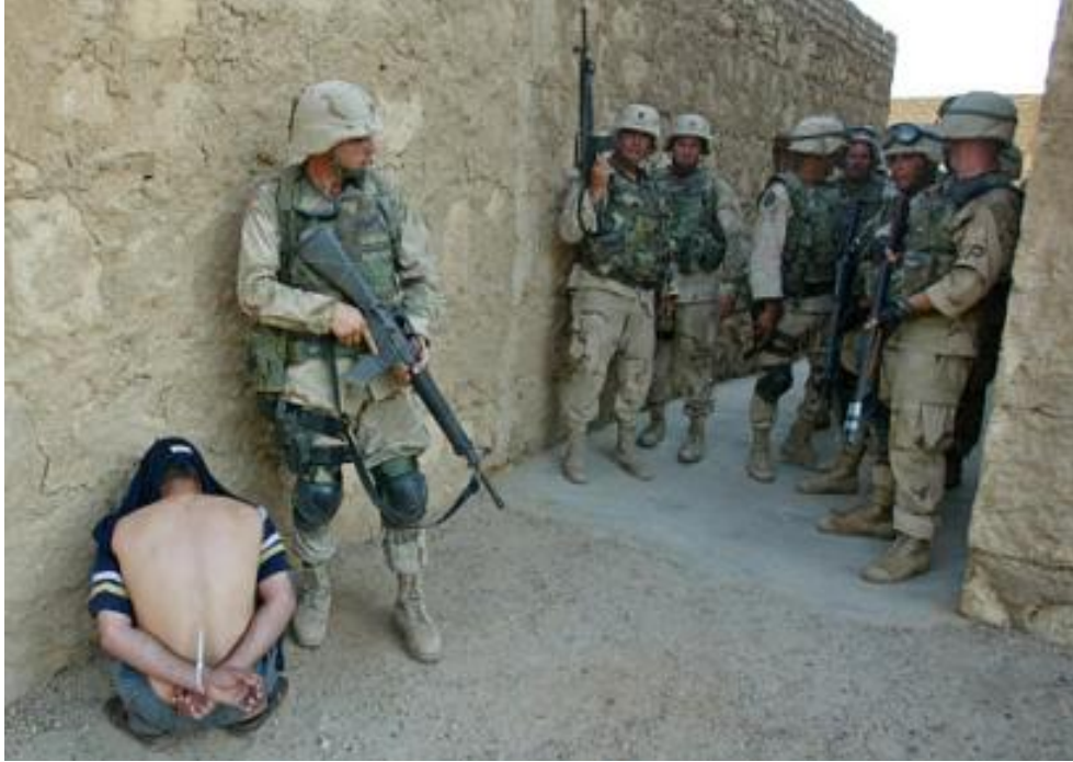
Soldiers with an arrested Iraqi citizen during a raid at Khaldiya, Iraq June 16, 2003.