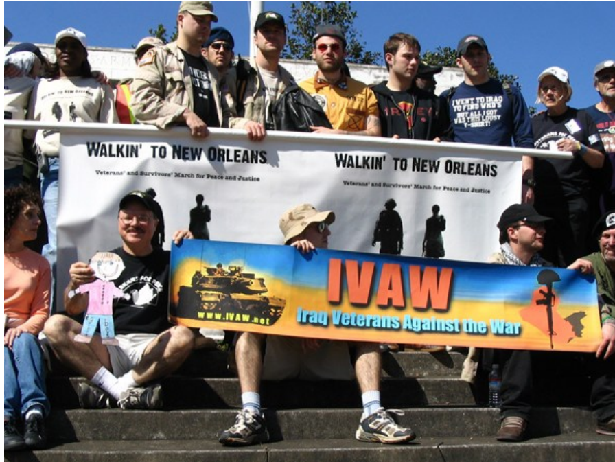
Iraq Veterans Against the War

Veterans and Survivors march from Mobile to New Orleans