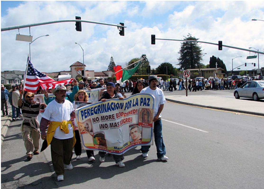
Not in Our Name Mar. 25, 2006 [jeff@paterson.net]