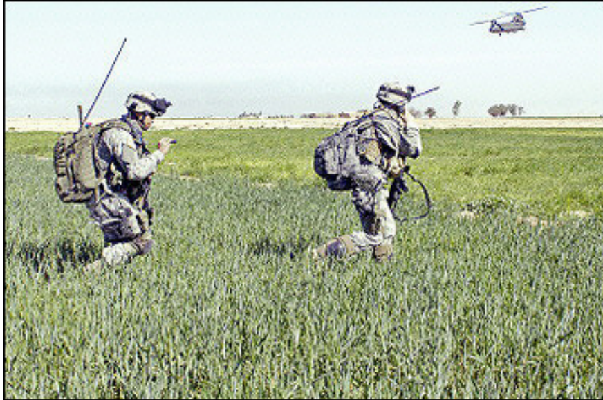
US soldiers during Operation Swarmer north of Baghdad.