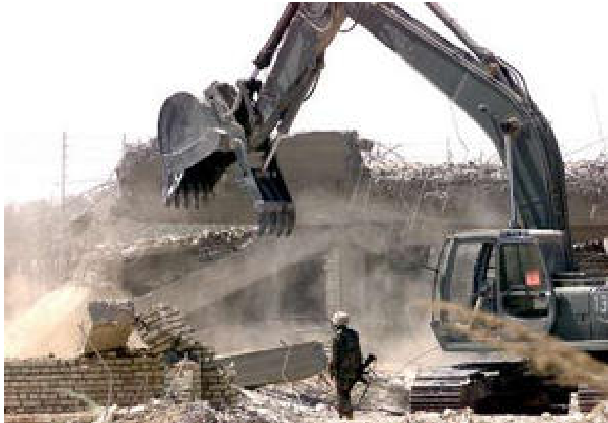
A U.S. Army digger destroys one of several houses in Ramadi June 3, 2003.