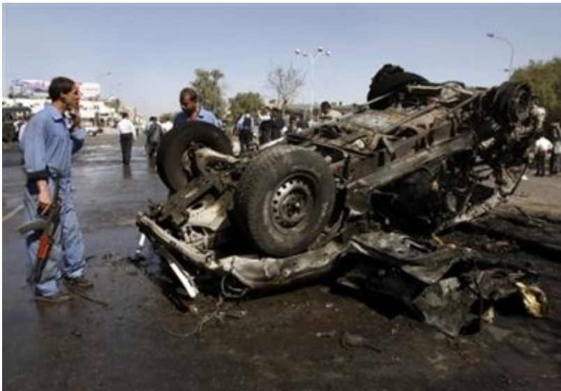
The wreckage of a police car damaged in a car bomb attack, in Baghdad March 23, 2006.

March 23, 2006. AFP & SINAN SALAHEDDIN, Associated Press Writer & Reuters