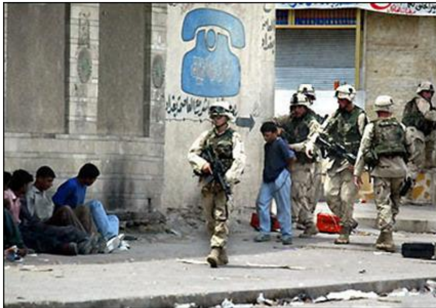
US soldiers arrest Iraqi children in Mosul, 2004.

OCCUPATION ISN'T LIBERATION BRING ALL THE TROOPS HOME NOW!