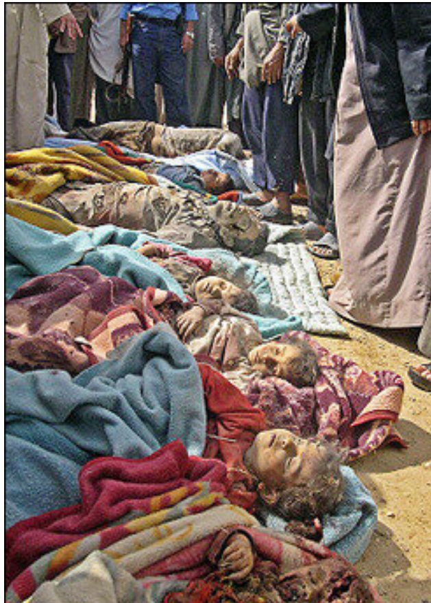
Iraqis gather near bodies of men and children, who were killed during a U.S. raid in Ishaqi area near the city of Balad, north of Baghdad, on March 15.