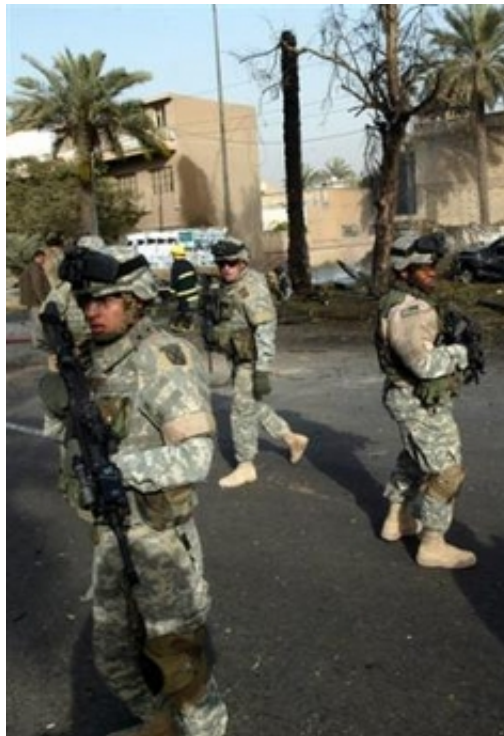
U.S. soldiers in the area after a car bomb exploded near the green zone, in Baghdad, March 13, 2006.