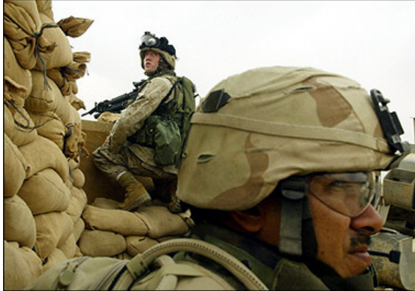
A US marine and a US Army soldier man their position on the rooftop of a hotel in Ramadi.

So Much For “That Progress In Iraq” Bullshit