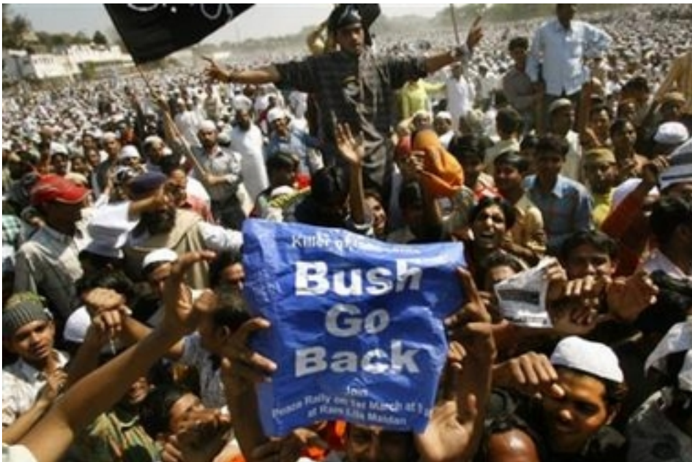
Indian protesters rally against Bush in New Delhi March 1, 2006.