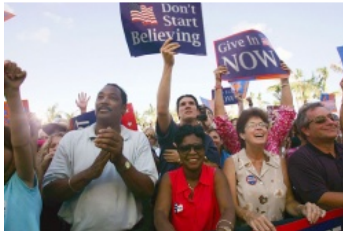
Democratic Party faithful cheer on their leaders' resolutely defeatist agenda.