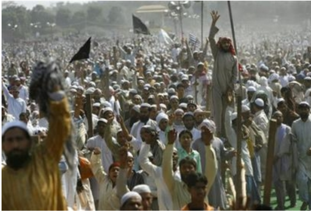
Indian protesters rally against U.S. President George W. Bush in New Delhi Wednesday, March 1, 2006.