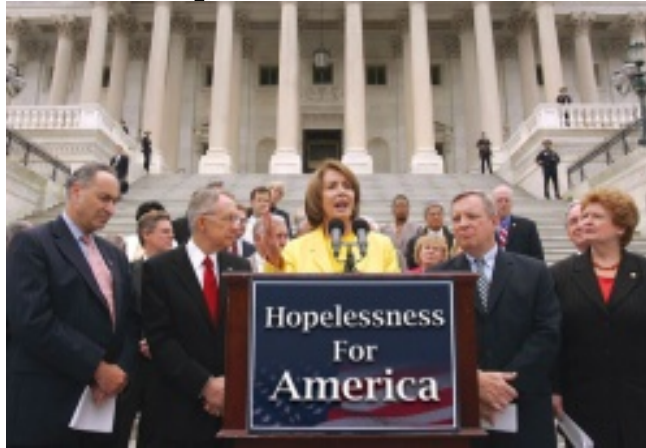
House Minority Leader Nancy Pelosi reaffirms the Democratic Party's promise to remain marginalized