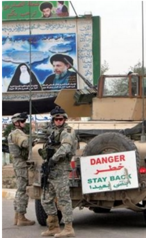
U.S. soldiers in west Baghdad, Feb. 27, 2006.